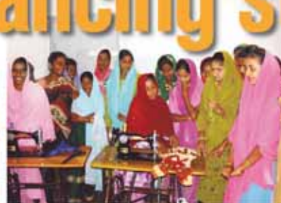
▲ Making saris, a growing business ▼ Education and equality for everyone