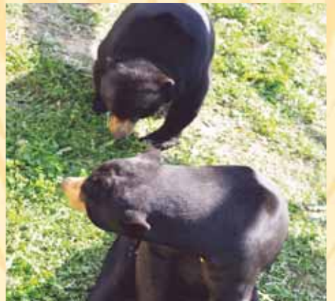
The French Connection