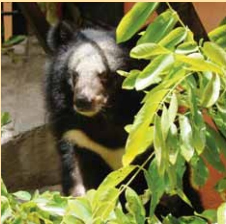
Rose looking very rosey