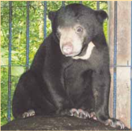
I feel much better today