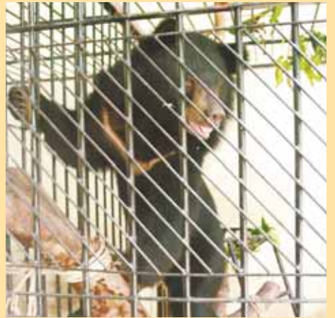
What time's dinner?