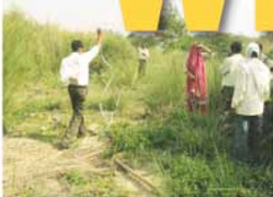
▲ Planning the night dens ▼ Delivery Kalandar-style