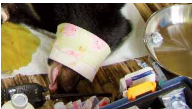
A very sick little bear receiving emergency aid upon arrival