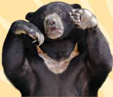
"Ipoh", ooh la la