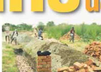
▲ Den construction underway ▼ "A new business, a new beginning"