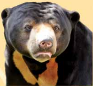
I'm Sai, the good looking one