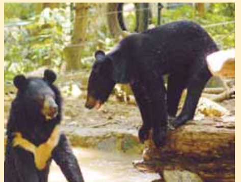
Kayasin and Deng: pay attention, it'll be a forward leap from the pike position!