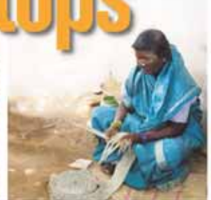
▲ Old skills, new opportunities ▼ Auto rickshaw