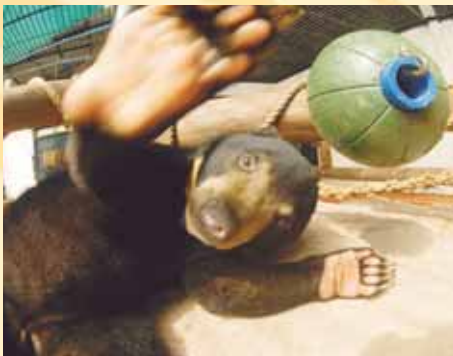
Buddy, showing a Sun bear's amazing ability to bounce-back from adversity