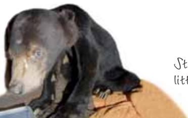
Starved and abused: a depressed little Sun bear upon arrival