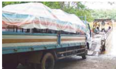
Negotiating the Dong Nai river to relocate our new arrivals

A battering of strong winds and storms in September slowed construction but, overall, our building work is progressing well with an official opening due in the New Year.