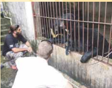
A priceless meeting (these bears are now in our sanctuary)